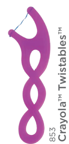
853 Crayola™ Twistables™