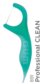
891 Professional CLEAN