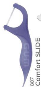
887 Comfort SLIDE