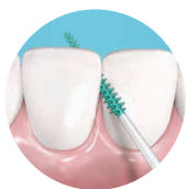
Healthy Gums (Non-compliant flossers)

SOFT-PICKS® Comfort Flex MINT - 670 SOFT-PICKS® Advanced - 650