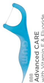
888 Advanced CARE with Vitamin E & Fluoride