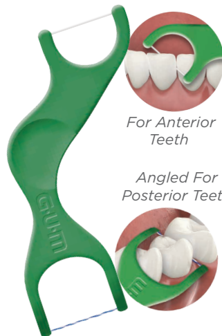
For Anterior Teeth