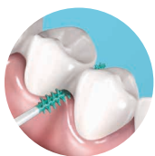
Implants, Bridges or Crowns